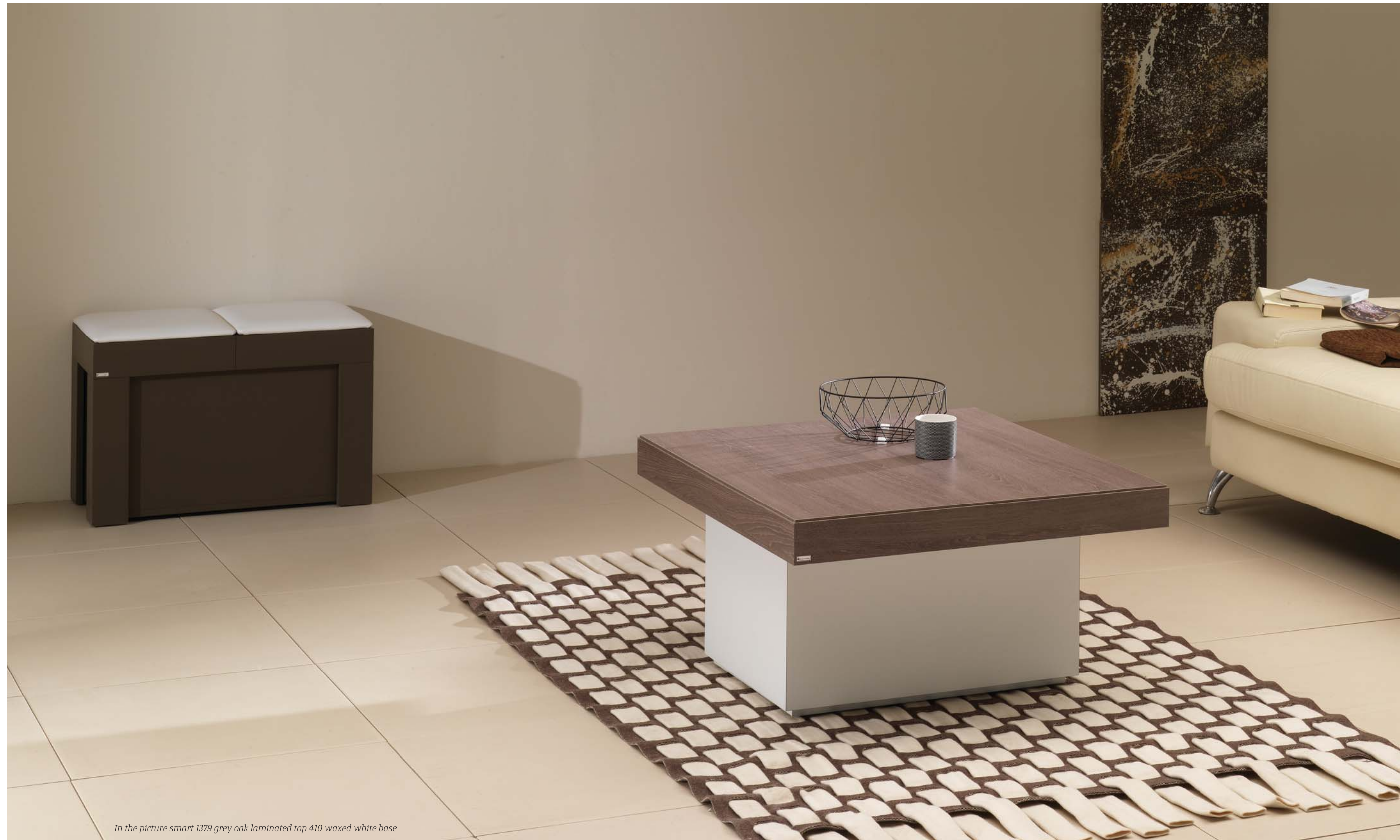
In the picture smart 1379 grey oak laminated top 410 waxed white base

Three functions in one table. In a living room for a break or in the middle of a dining room for lunch or a meeting. The table Smart uses a refined and functional system of extension.